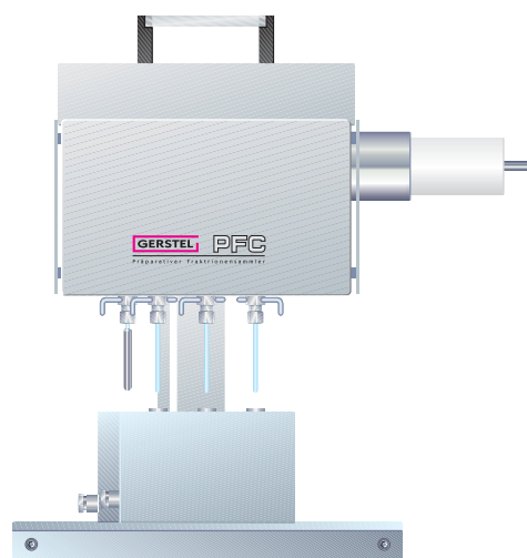
GERSTEL PFC with rigid transfer line mounted on the right hand side.